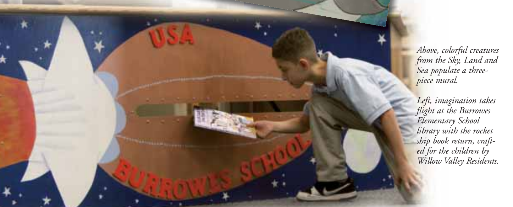
Above, colorful creatures from the Sky, Land and Sea populate a three-piece mural.